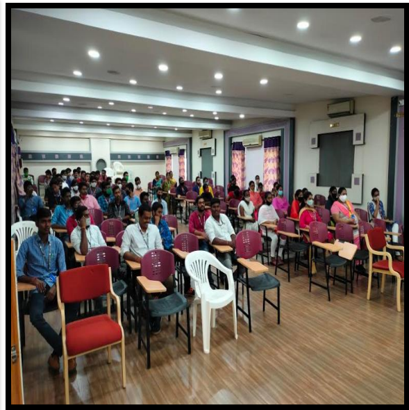
Students listening the Awareness Program on Indian Engineering Services